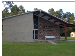
The Patty Johnston Memorial Tabernacle

The recreation hall is equipped with a pool table, ping-pong tables, air hockey tables, foosball tables, and carpet ball tables, which will provide fun for the whole family.