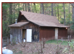
The Bathhouse has a men's side and women's side.

The dining hall is equipped with a full kitchen with two refrigerator and freezer combos, an industrial size stove and oven, an ice machine, and a side by side commercial freezer. The dining hall has the available capacity of 100 people.