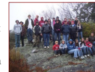
Hiking in nearby Highlands, NC is a good way to spend the afternoon.

Along with the recreation activities at the camp, there are numerous nearby attractions. The tourist town of Highlands, NC is only 15 minutes from the camp facility and offers shopping, a community swimming pool, among other attractions. Numerous hiking trails, fishing locations, and waterfalls are within thirty minutes driving distance from the camp.