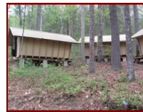
Seven birdhouses will sleep eight people each.

In total, there are seven cabins with the capacity of eight persons each. Cabins do not have heating or cooling units. However, the summer breeze at night keeps the cabins cool in the warmer months. There is also a duplex that sleeps approximately four people per side.